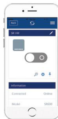
Easy to edit settings