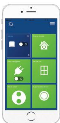
Easy to control