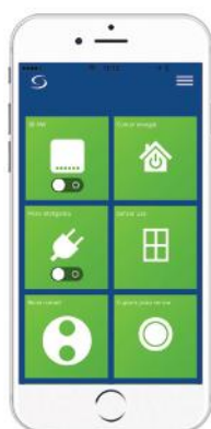
Easy to manage icons

The Smart Home App is available on IOS and Android. With easy to use functions and simple to add heating schedules.